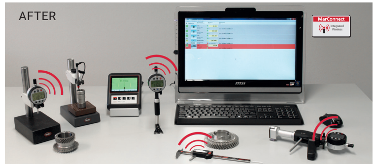
Innovative measuring station – with Integrated Wireless

For more information please visit or contact