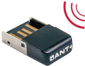
The MarConnect i-Stick