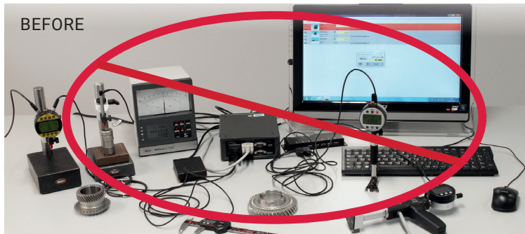
Conventional measuring station – with cable connection